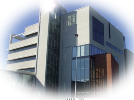
1918 TALLINNA TEHNIKAÜLIKOOL TALLINN UNIVERSITY OF TECHNOLOGY